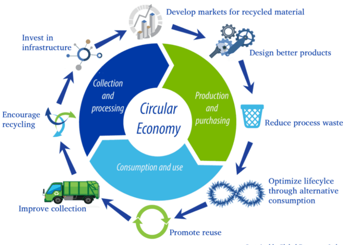
Image: Sustainable Global Resources Ltd. Recycling Council of Ontario