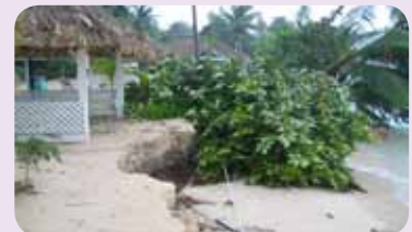
Storm surge damage, Tobago.

The vision for CARIBSAVE is longevity; a sustained approach to address the challenges that climate change presents for the Caribbean's tourism sector, national economies, community livelihoods and key related sectors (i.e. water, energy, biodiversity, agriculture, human health, disaster risk management and infrastructure). This durability will be achieved by a multi-donor, multi-objective approach; involving regional organisations, country partners, ensuring regional ownership, and by drawing on experts and institutions in the region and internationally to create a strong, highly motivated and experienced team of long-term partners. This approach is essential to initiate the urgent action required for the protection and benefit of the people of the Caribbean, their environments and economic development.