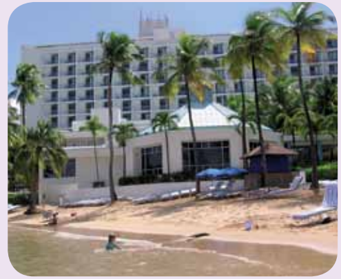
Coastal infrastructure at risk.

In addition to its partner countries and other active partners the CARIBSAVE Partnership includes the following supportive organizations and institutes. The CARIBSAVE Partnership is working together to protect and enhance the livelihoods, environments and economies of the Caribbean Basin. CARIBSAVE works on adaptation and mitigation; to reduce emissions and enhance the sinks of greenhouse gases and to adapt to the impacts and challenges of climate change.