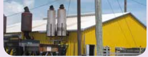
Fossil fuel powered energy station.