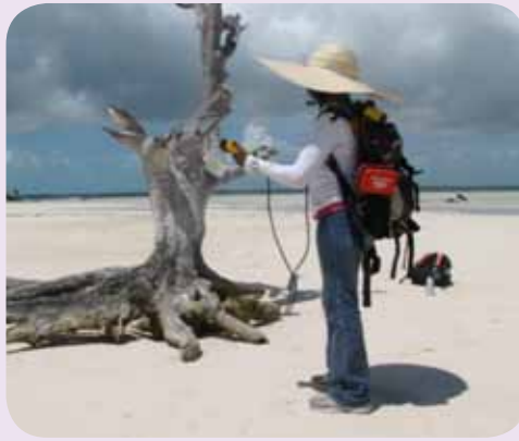
Digital Elevation Modelling by Caribbean Meteorological Services.