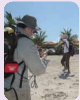
Digital Elevation Modelling and data collection.

Comprising seven Core Objectives, the CARIBSAVE Partnership has a projected budget of US$35 Million over the next 5 years. The Partnership is focused on: sectoral, destinational and national vulnerability and adaptive capacity assessments and strategy development; community-based adaptation; socio-economic and environmental policies and implementation; the impacts of climate change on key sectors and their integral relationship to tourism in the Caribbean; the development of low carbon economies and carbon neutral destination status; and capacity building and skills transfer activities across the Caribbean Basin.