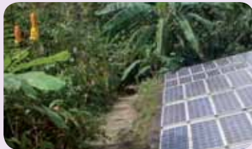
Solar powered energy for destinations.

The Caribbean is the most tourism-dependent region in the world with few options to develop alternative economic sectors. The region is one of the most vulnerable in the world to the impacts of climate change including sea level rise, biodiversity loss, impacts on human health and extreme events.