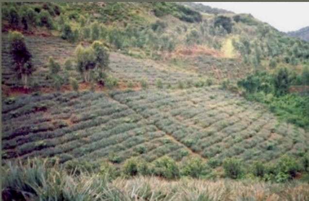
Contour planting on mountains slopes at Les Mariannes