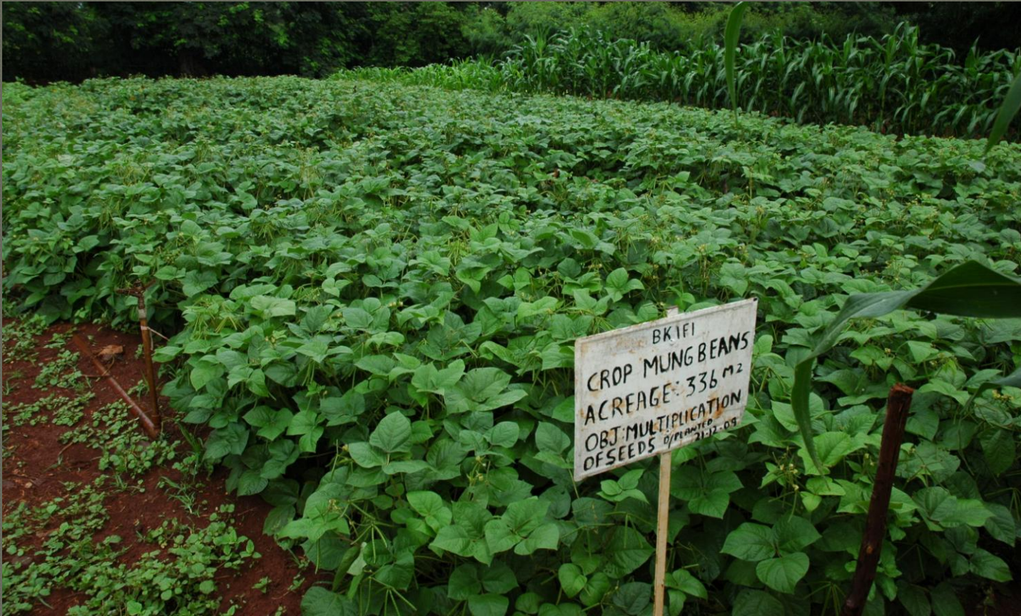
Mungbean Trial at Richelieu Experimental Station