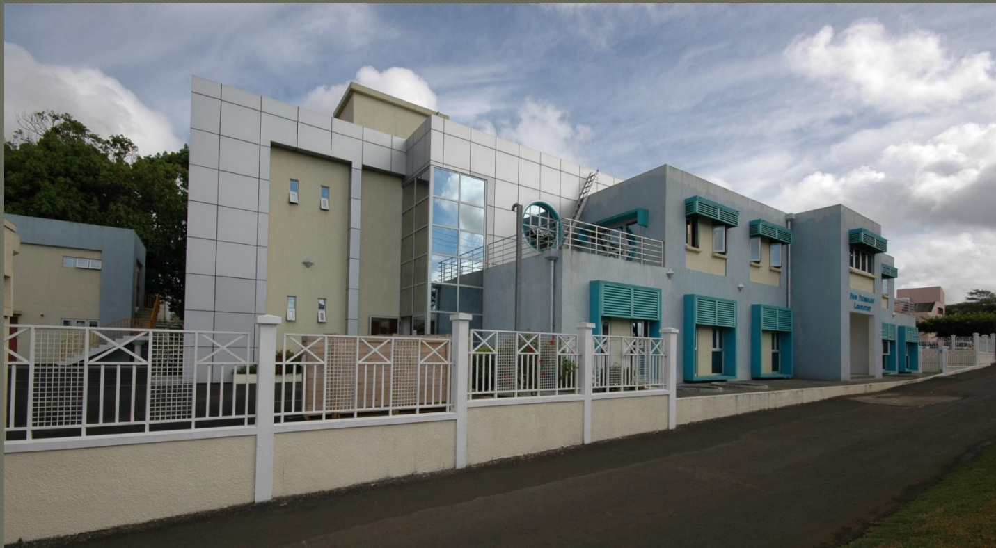
Food Technology Laboratory, Réduit