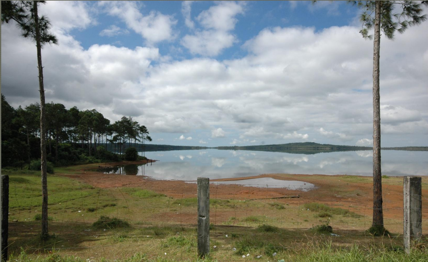
Mare aux Vacoas Reservoir