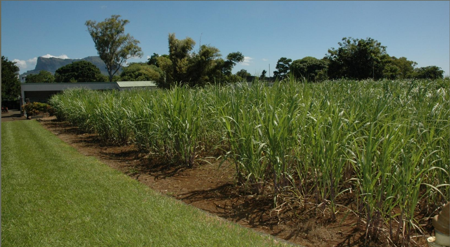
Sugar Cane GeneBank at the MSIRI, Réduit