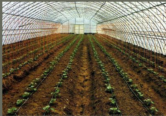
Use of Tensiometers, to monitor soil moisture for irrigation scheduling