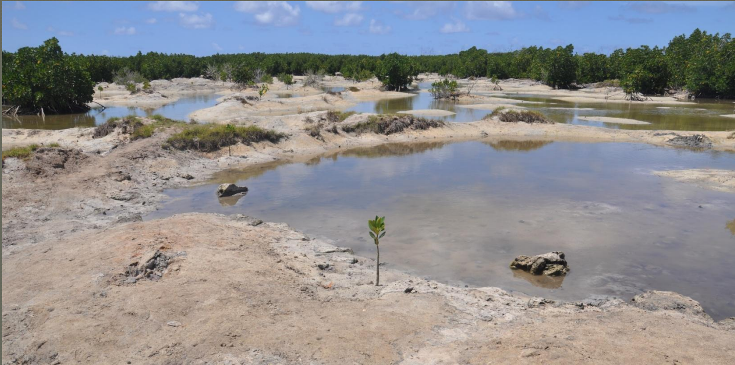
Pointe D'Esny Protected Wetland - NPCCS