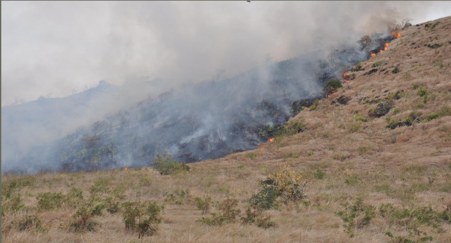
Fire on Signal Mountain