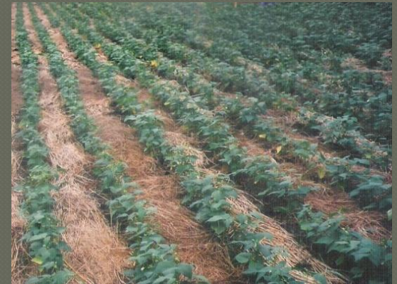
Mulching to conserve soil moisture