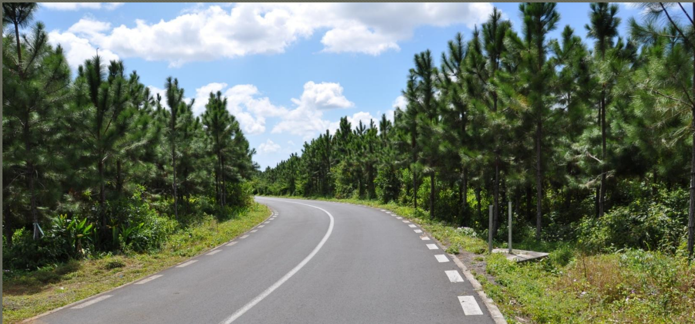
Forest in Catchment Area of La Nicolière