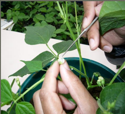
Screening of variety