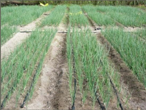
Drip fertigation in onion