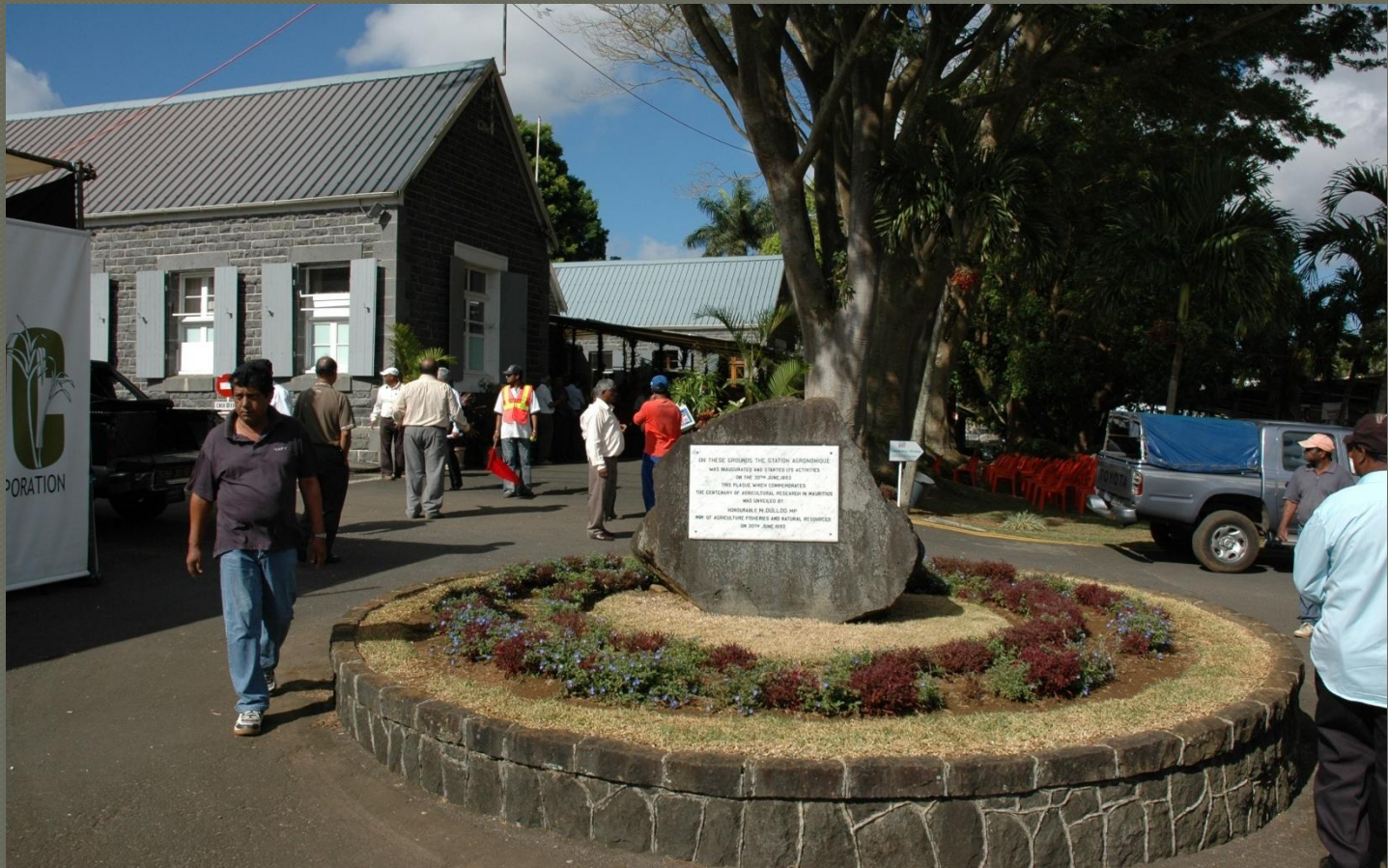
Agricultural Services During World Food Day, Réduit