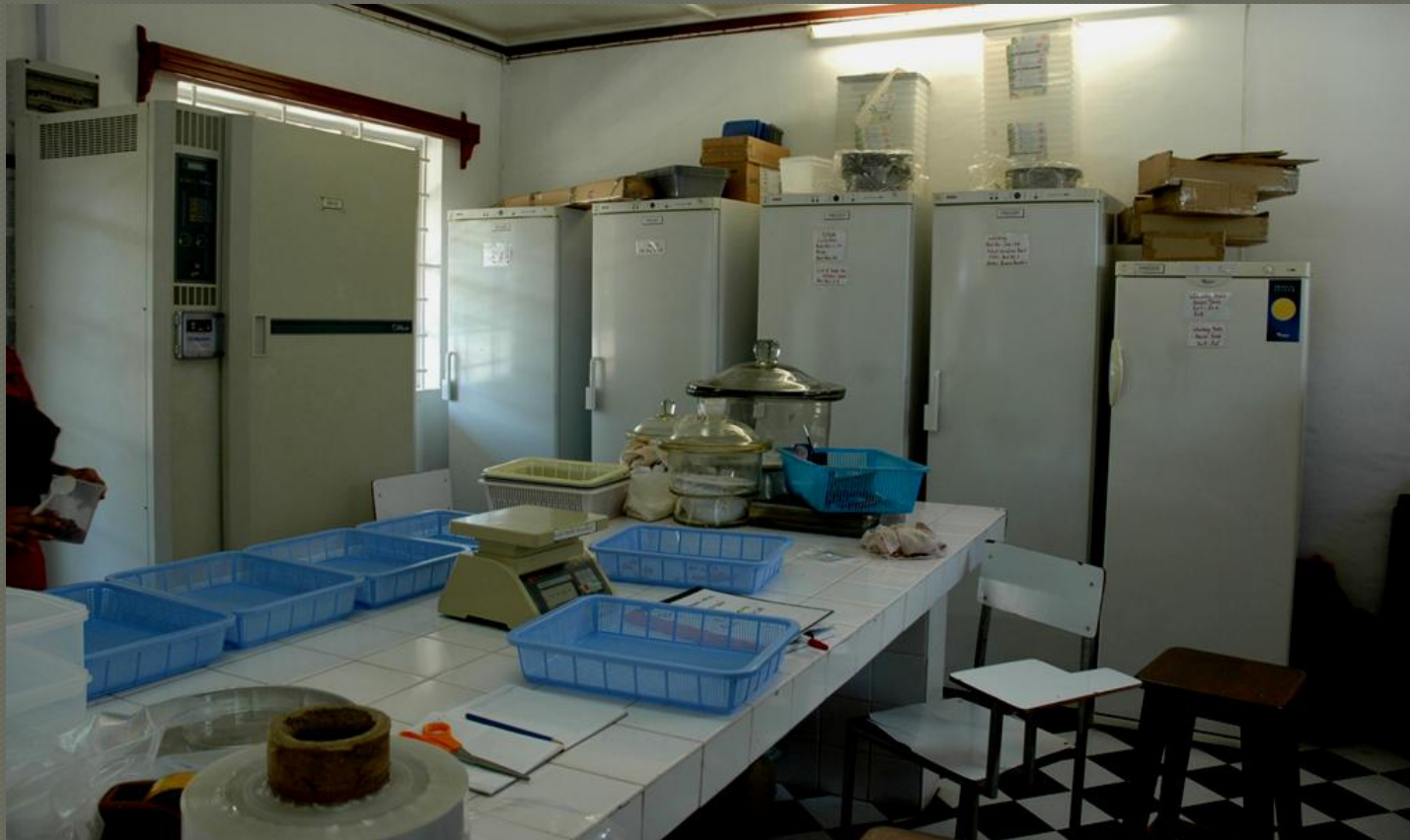
Plant Genetic Resource Seed Genebank, Curepipe