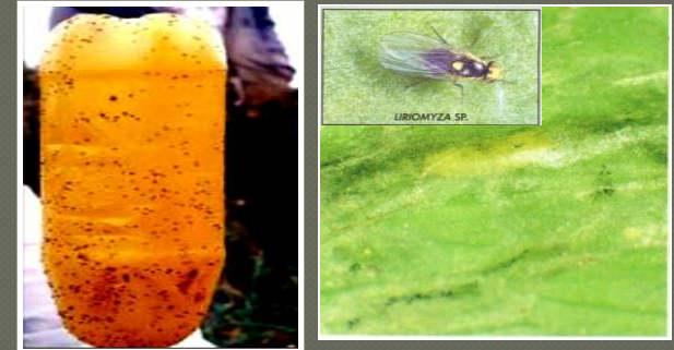
Yellow sticky trap for Leaf miner