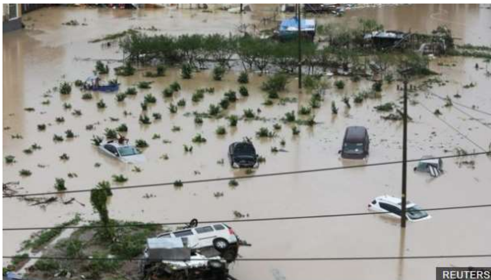
Cars were left partially submerged in water in Wenzhou, Zhejiang province

Lekima has now passed over Shanghai and is expected to hit Shandong province later on Sunday.