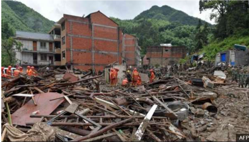
Rescuers search for survivors following a landslide in Wenzhou

In Zhejiang province, Lekima damaged crops and 34,000 houses. The direct economic loss amounts to 14.57 billion yuan (£1.7 billion), state media said.