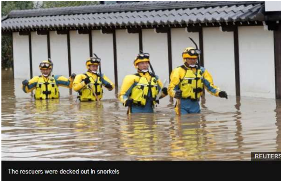
The rescuers were decked out in snorkels

A train depot in Nagano was also flooded, causing 10 high speed ("bullet") trains to be submerged. Each train has been valued at $30m (£23m).