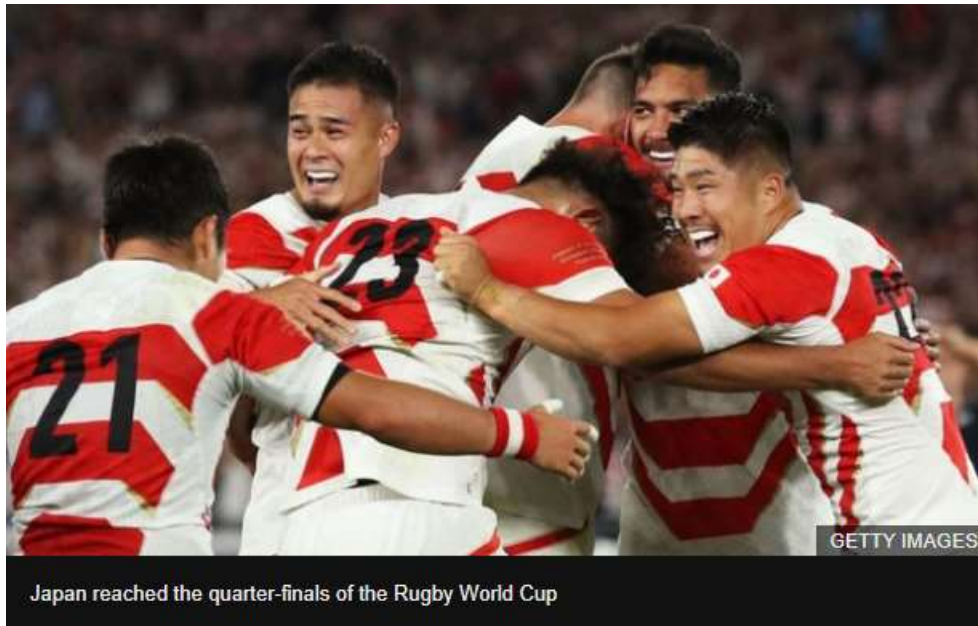
Japan reached the quarter-finals of the Rugby World Cup

The typhoon has weakened and moved away from land but has left a trail of destruction.