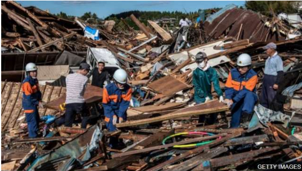
Typhoon Hagibis was the worst storm to hit the country in decades

More than 110,000 people are taking part in search and rescue operations after Typhoon Hagibis struck Japan on Saturday.