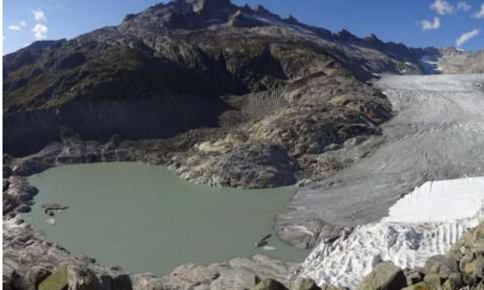
The Rhône glacier was the largest in the European Alps during the most recent ice age, approximately 20,000 years ago. Since then, it has receded to a typical valley glacier.