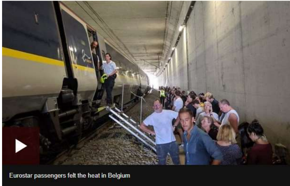
Eurostar passengers felt the heat in Belgium

Authorities launched a red alert - the highest state of alert - in the Paris region and 19 other French departments, calling for "absolute vigilance", and comparisons were drawn to a heatwave in August 2003, which contributed to almost 15,000 deaths.