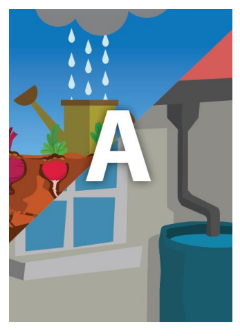
Example of an alphabet card